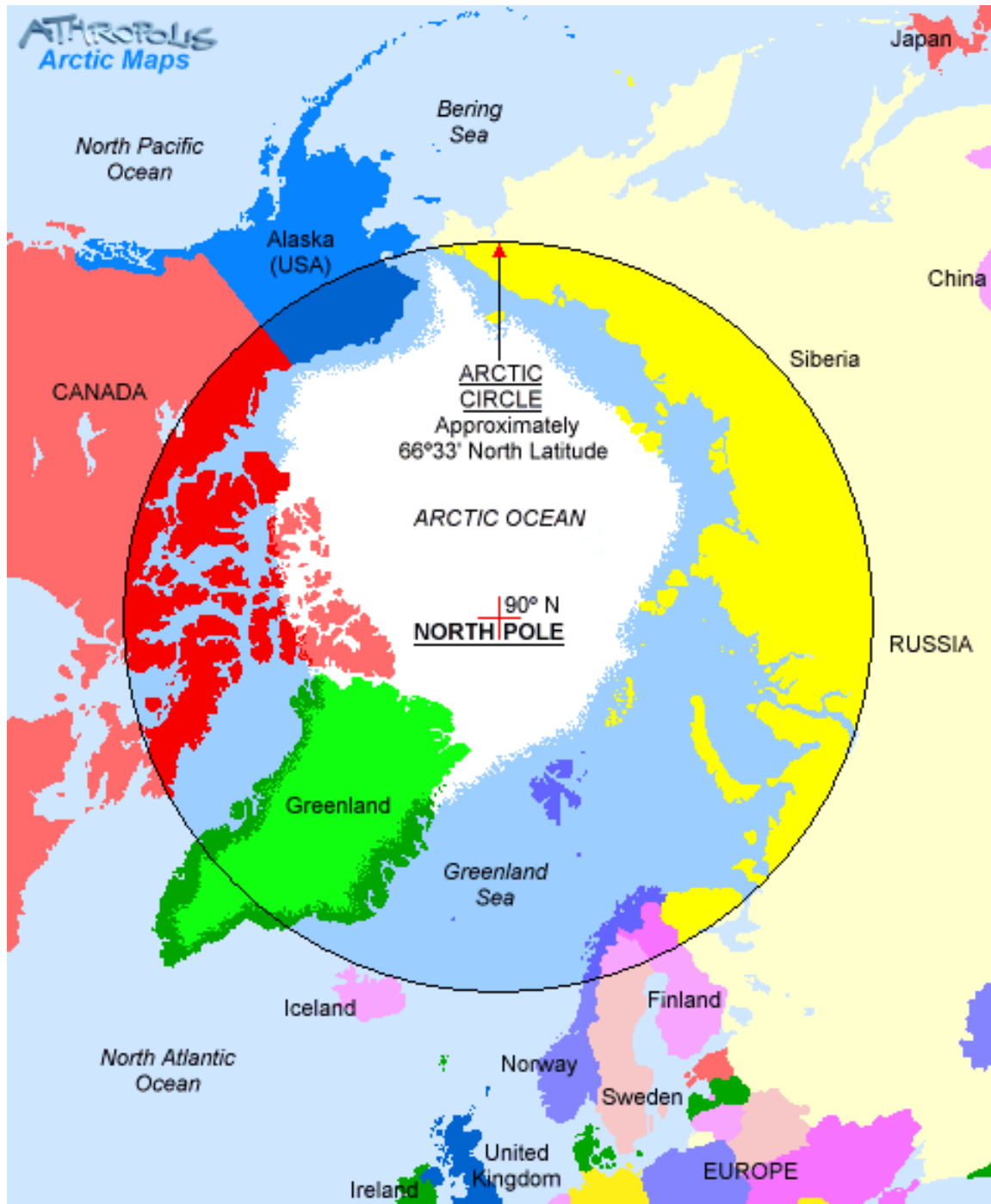
Figure 1. Arctic Circle and the Arctic nations 5