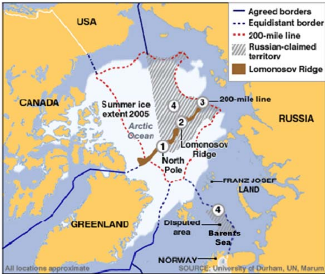
Figure 2. Lomonosov Ridge and Barents Sea dispute areas 109