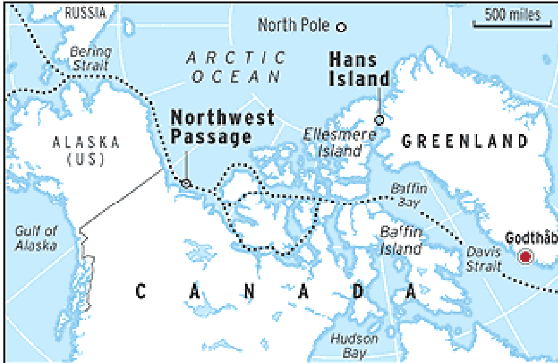
Figure 4. Northwest Passage and Hans Island 137