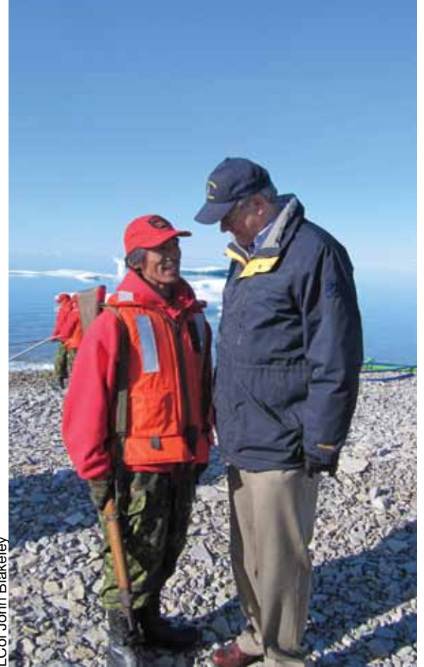
Prime Minister Harper talks with a Canadian Ranger in Resolute Bay during Operation NANOOK 10.

all come from hev walks of life. Some are mayors, chiefs, teachers or businessmen, and some earn their keep off the land by hunting and fishing. They are of all ages and both genders; most are First Nations people - but many are not. But they all share some invaluable traits. An extraordinary knowledge and sense of the vast and rugged spaces of our land, primarily in the North but not exclusively so, as they are also found almost everywhere Canada has a coast line, from the West Coast, to the shores of Hudson Bay to the St. Lawrence Estuary to the shores of Newfoundland and Labrador. They operate in conditions that no reality show could emulate, where the weather is often cold, cruel and unpredictable, and where the land is often covered with snow and a cloaked in darkness, and inhabited places are few and far between. These are our Canadian Rangers whose over 4,000 members, scattered in patrol groups at over C 170 locations throughout Canada, provide a strategic resource to the Canadian Forces (CF) out of