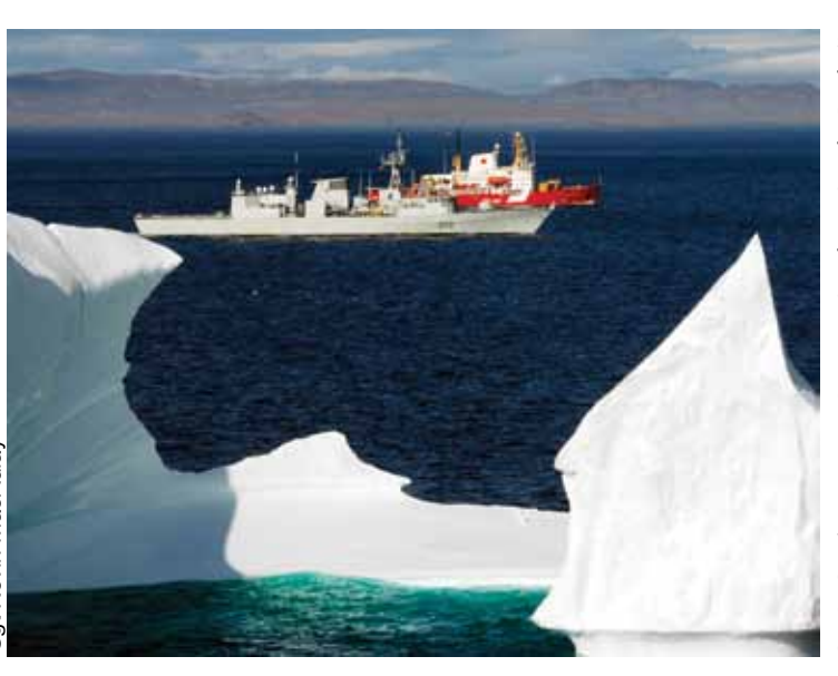
Her Majesty's Canadian Ship (HMCS) Toronto and Canadian Coast Guard Ship (CCGS) Pierre Radisson sail past an iceberg in the Hudson Strait off the coast of Baffin Island, during Operation NANOOK 08.

as supporting other government agencies and organizations. CCG services in the Arctic include providing ice information and ice routing advice to the marine shipping industry, as well as conducting escorts through ice, where needed.