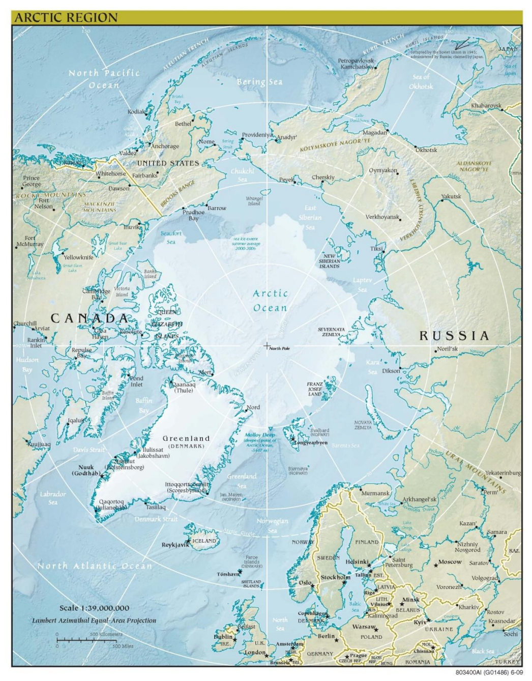
CIA World Factbook